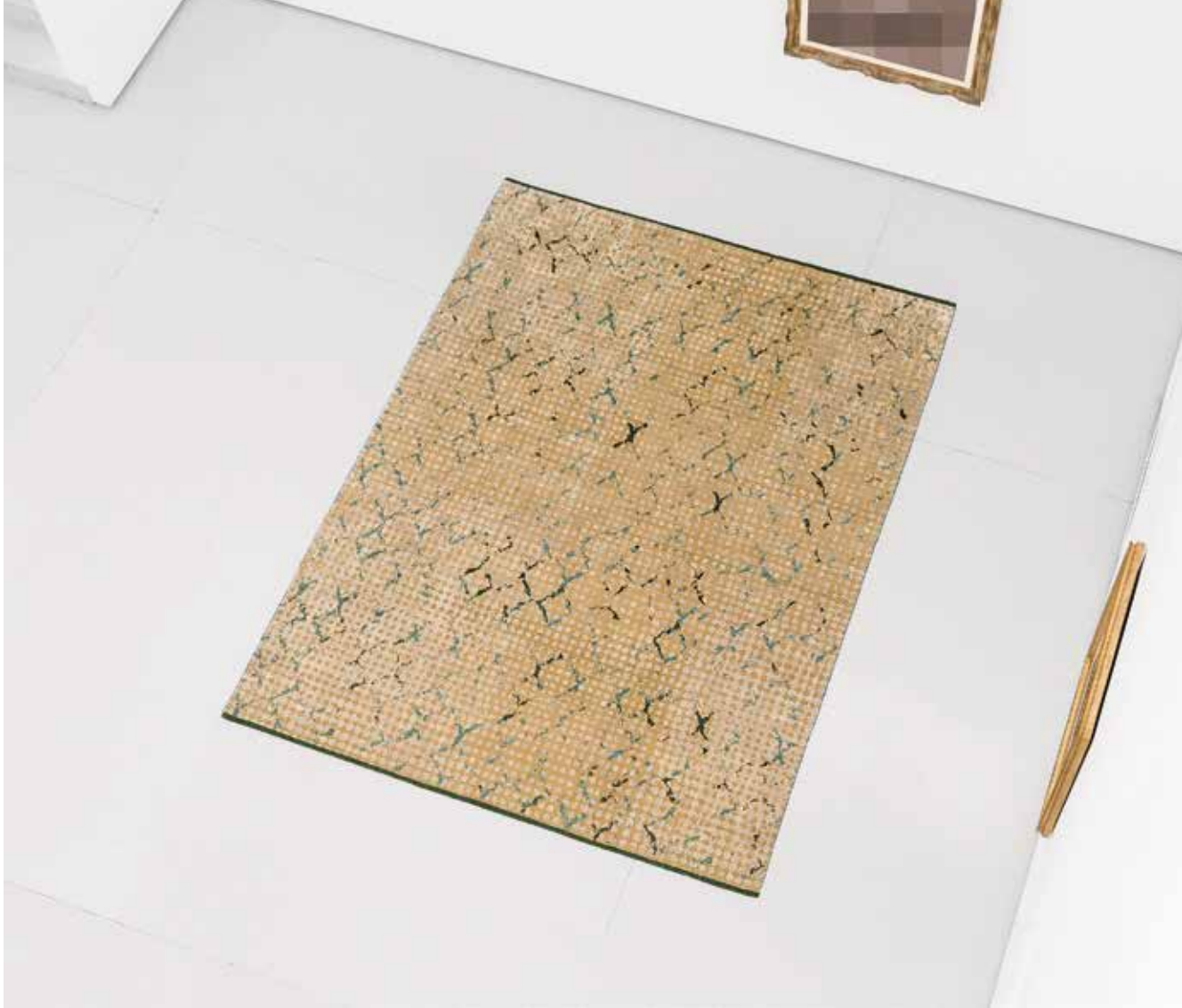
HENDRIX - CREAM