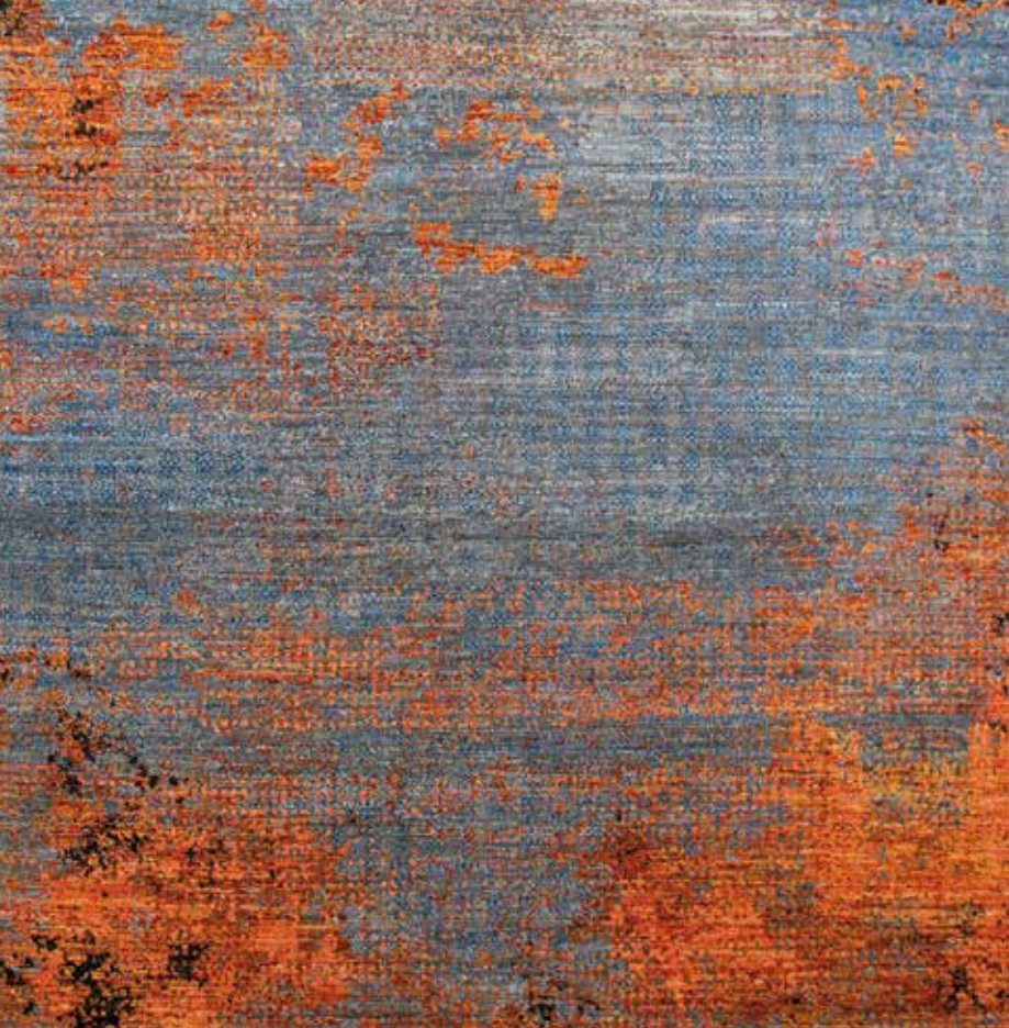
PRINT ON PRINT - TANGERINE